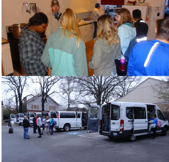
Sleepy university students prepare for travel, load their vans and await the drivers at 7:06 a.m. on Sunday, March 11, 2018