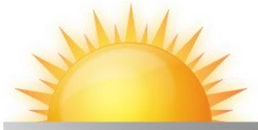
Sunrise image