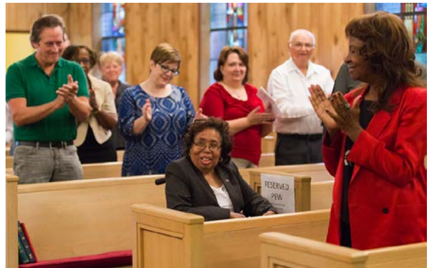
On November 5 th our special guest Thelma Mothershed-Wair received a round of applause in commendation of her courage in 1957 as one of The Little Rock Nine.

May we all use this advent season to prepare our hearts and minds to receive God's gift of Emmanuel, Jesus, our Savior.