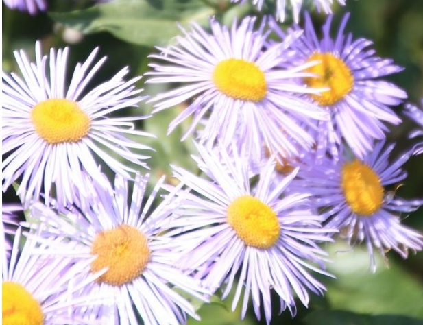
Flowers, Grand Teton National Park, 2016

Pulaski Heights Christian Church – web: phcc-lr.org | March 2017 – Volume 70 No. 3