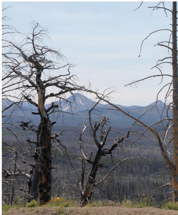
Slowly recovering forest 2016, fire was in 1988.

Lenten Luncheon: Fri. Apr. 7 9 – Palm Sunday 12 – 6:00 pm Board Meeting 13 – 6:30 pm Joint Maundy Thursday Service at Parkview CC 14 – 6:30 pm Tenebrae Good Friday Service at PHCC 16 – Easter Sunday ; Sign May birthday cards. 17 – Third Monday Meal is served; 1101 W. Markham St. 30 – Community Breakfast ; 7:30 a.m. Quapaw Quarter United Methodist Church, 1601 S. Louisiana St. – Sunday School Apr. 2, 9, 16, 23, 30