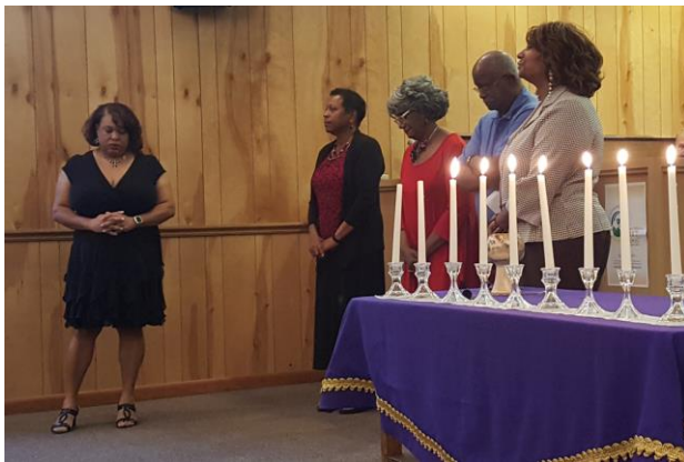
Cross Street Christian Choir

The nine objects were: an ointment jar, a cup, a sword, a ceramic rooster, 30 pieces of silver, a water bowl and towel, a crown of thorns, a hammer and three nails, with the last object being a purple cloth that was rent in two.