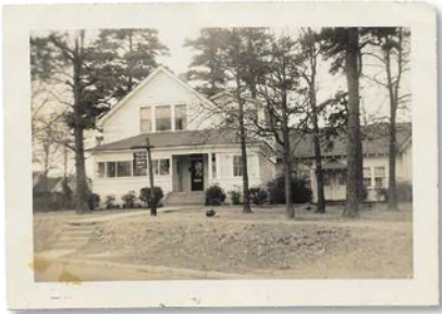
These photos were taken of the original buildings of the church before the Sanctuary was moved west, and the educational building was built.