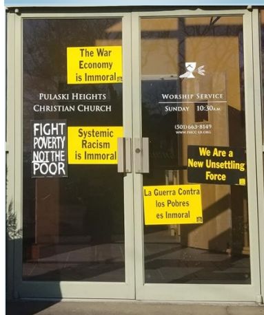
PHCC Sanctuary Entrance