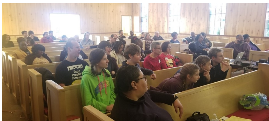
Members and guests view the documentary, "We Cried Power," in the Sanctuary.